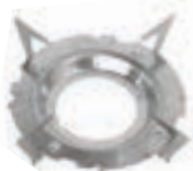
Pot Support Included

Individual cooking and convenient eating — our most popular regulated system.