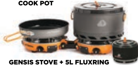
GENESIS STOVE + 5L FLUXRING COOK POT + LUNA + 1.5L CERAMIC FLUXRING COOK POT