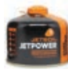
JetPower Fuel Canisters