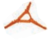
Fuel Can Stabilizer