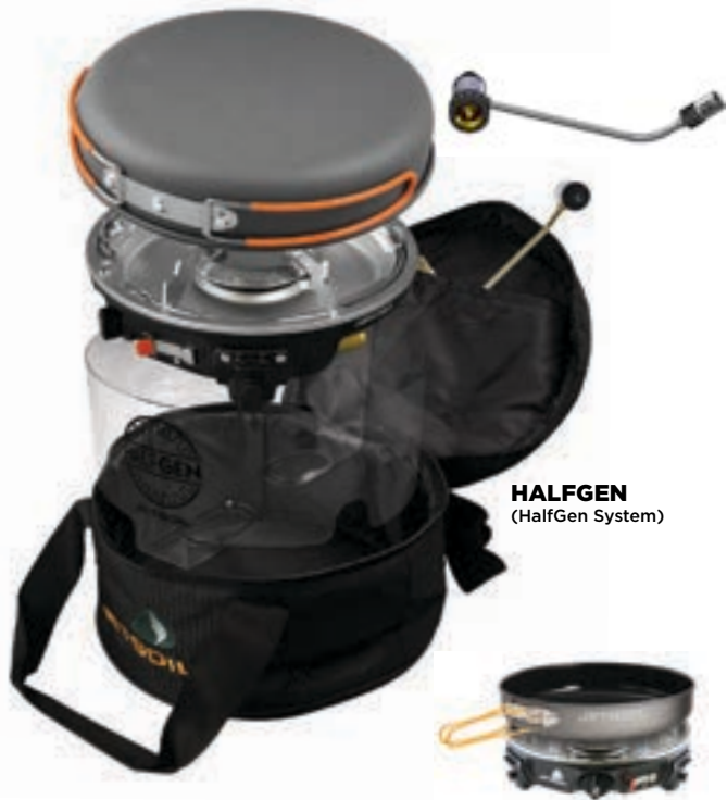
HALFGEN (HalfGen System)

Expanding your basecamp cooking possibilities.