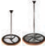
Silicone Coffee Presses