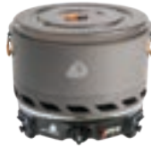
HALFGEN + 5L FLUXRING COOK POT