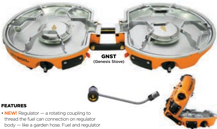
GNST (Genesis Stove)

Adding a compact cook top to your camp kitchen.