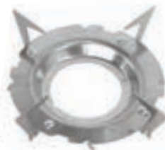
Pot support must be used when cooking on compatible Jetboil systems. (Sold Separately)