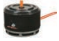
1.5L Ceramic FluxRing Cook Pot