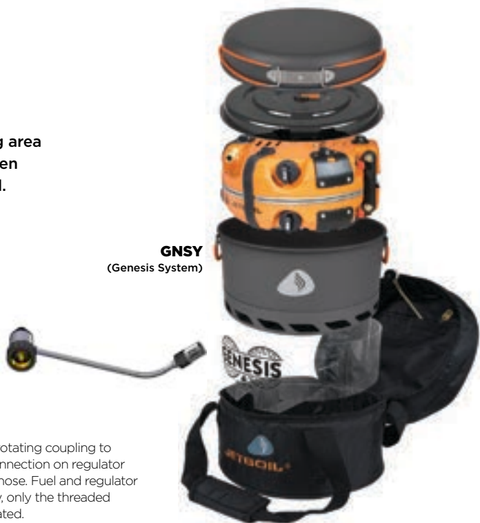
GNSY (Genesis System)

Maximum cooking area and versatility when you're off the grid.