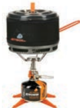
MightyMo is sold separately see page 19