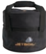
Genesis System Bag